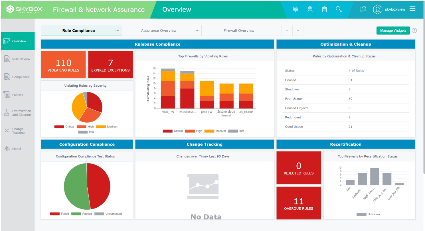
FIG 2: The overview dashboard of the Skybox Firewall and Network Assurance interface, providing a normalized view of rule and configuration compliance, optimization and cleanup status and rules awaiting recertification review.